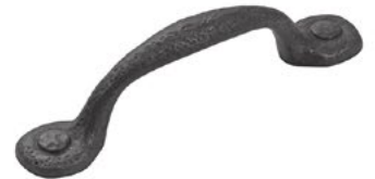
Forged Pull SH106