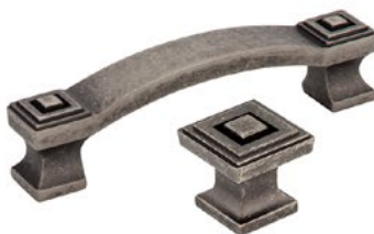
Silver Geometric Pull | Knob UH106 | UH107