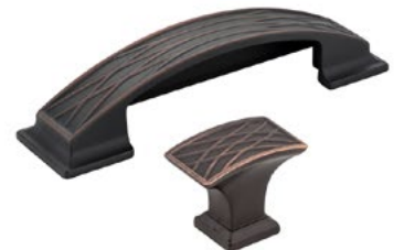
Woven Cup | Knob UH100 | UH101