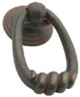
Rusted Knocker SH107