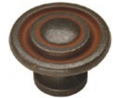
Rusted Knob SH109