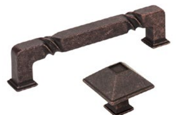
Twisted Pull | Knob UH102 | UH103