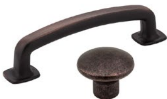
Bronze Simple Pull | Knob UH108 | UH109