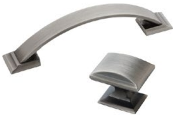
Elegant Pull | Knob SH104 | SH105