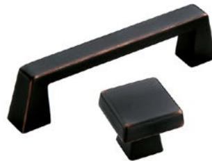
Modern Pull | Knob SH102 | SH103