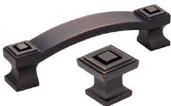
Bronze Geometric Pull | Knob UH104 | UH105