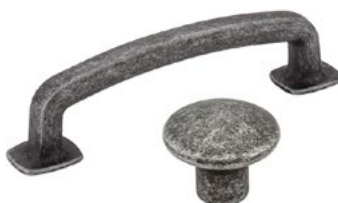
Silver Simple Pull | Knob UH110 | UH111