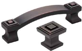
Bronze Geometric Pull | Knob UH104 | UH105