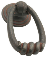
Rusted Knocker SH107