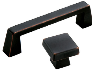
Modern Pull | Knob SH102 | SH103