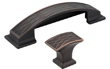
Woven Cup | Knob UH100 | UH101