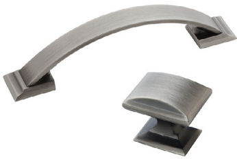
Elegant Pull | Knob SH106 | SH107