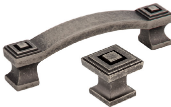
Silver Geometric Pull | Knob UH106 | UH107