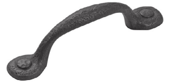
Forged Pull SH110