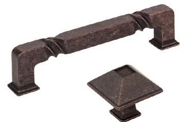
Twisted Pull | Knob UH102 | UH103