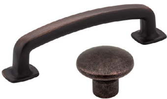
Bronze Simple Pull | Knob UH108 | UH109