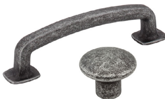
Silver Simple Pull | Knob UH110 | UH111