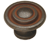
Rusted Knob SH109