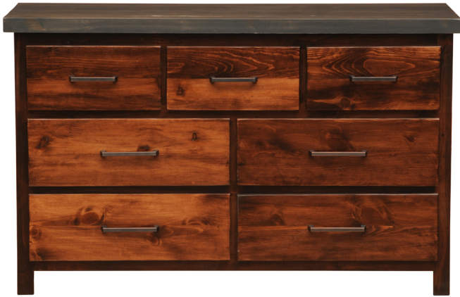
7-drawer dresser pictured, but use for all WoodShop orders minus complete beds and headboards (see separate form).

Use one form per unique item. For beds and headboards, see separate form.