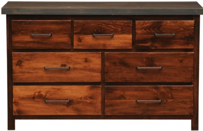
7-drawer dresser pictured, but use for all WoodShop casegood and nightstand orders

Use one form per unique item. For beds and headboards, see separate form.